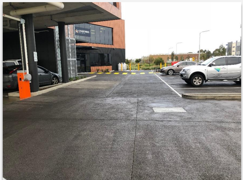
DRIVECON™ CHARCOAL OXIDE Café and office, Dandenong South VIC

Car parks, roadways, crossovers, footpaths, golf course paths, airport runways and taxiways, tree protection zones and water-sensitive areas where an increased level of permeability is required.