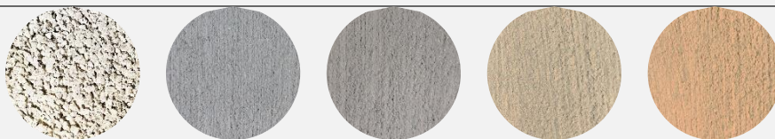
NATURAL BLUESTONE oxide CHARCOAL oxide SOAPSTONE oxide SANDSTONE oxide

While care is taken to correctly represent the final installed product, specifications and colours may vary without notice. Other colours are available upon request.